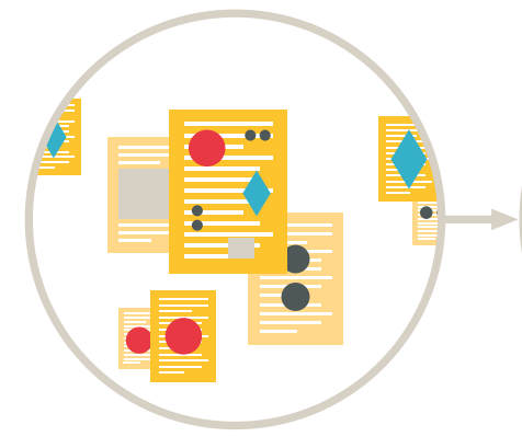
Researchers cite other research to acknowledge the material they used in writing their paper.